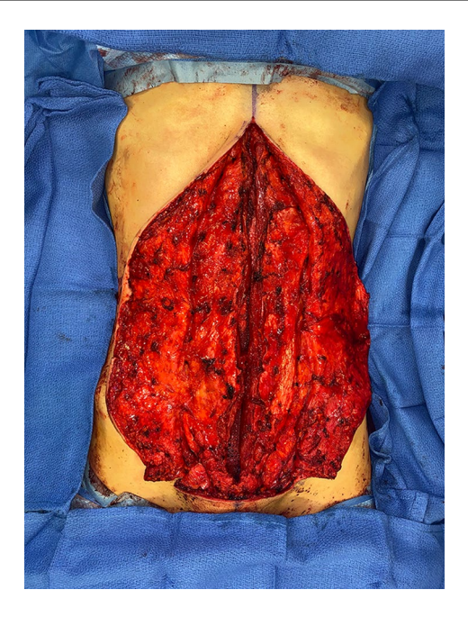
Fig. 3 Mesh completely inset, just before closure of the medial border of the rectus muscles. The laterally placed sutures serve to narrow the rectus muscles and emphasize the semilunar lines