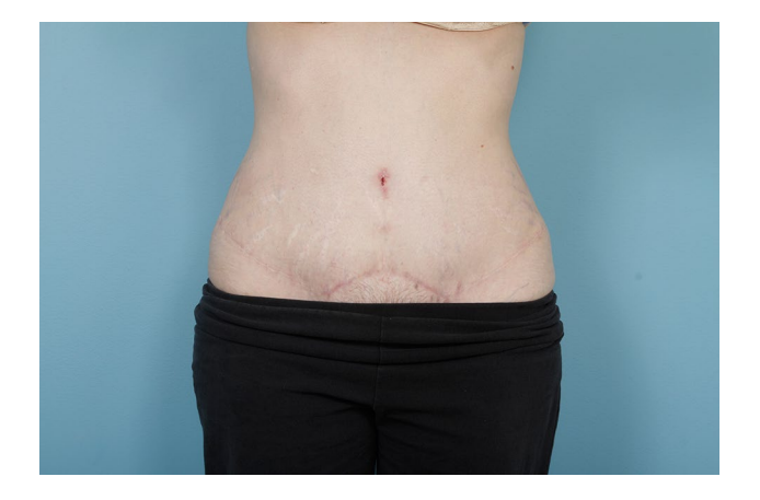
Fig. 8 Post-operative 1 year view of female patient who underwent a mesh abdominoplasty through a transverse incision

neo-umbilicus in a man. There were no rehospitalizations, and ten patients had soft tissue revisions as office procedures for improved aesthetics. One patient complained of localized abdominal wall pain at 6 months after surgery that resolved with physical therapy. One patient underwent retightening of her abdominal wall after a mesh abdominoplasty. The tentative diagnosis for this patient was new stretching of the abdominal wall lateral to the semilunar lines. A recent report documented the aesthetics of this procedure for female patients [17]. Patients with severe rectus diastasis have worse preoperative aesthetic scores than do patients with milder diastasis who are undergoing suture plication. Both groups have similar improvements in aesthetic scores, but the suture plication group starts with improved aesthetics and remains aesthetically more pleasing than the mesh group as judged by four blinded observers.